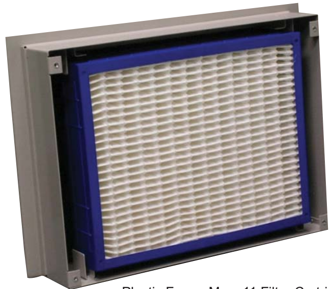
Plastic Frame Merv 11 Filter Cartridge

Bring us your most challenging filtration problems!