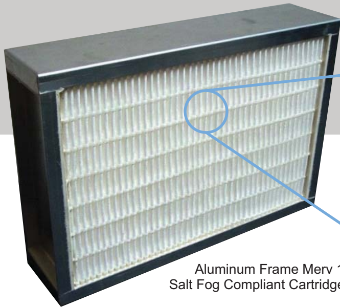
Aluminum Frame Merv 16 Salt Fog Compliant Cartridge

Schrofftech offers engineered ambient thermal solutions for the telecommunications and other market segments. It combines state of the art filtration with modern control systems to achieve the lowest possible energy consumption.